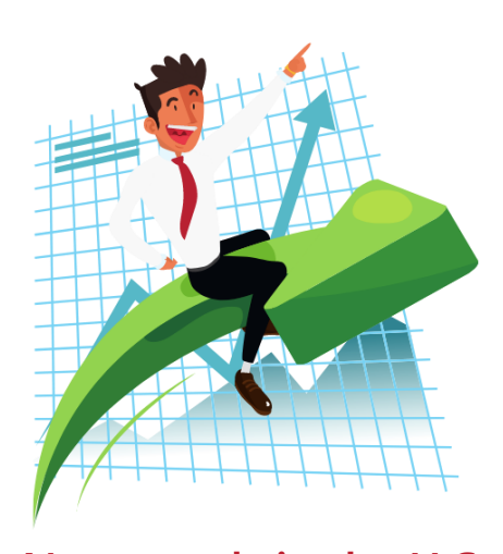
New trends in the U.S.