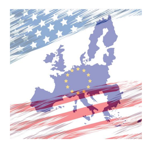
Different rules & regulations between the EU & the U.S.