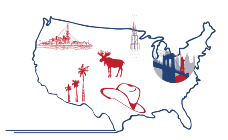
Business, social & cultural differences between states