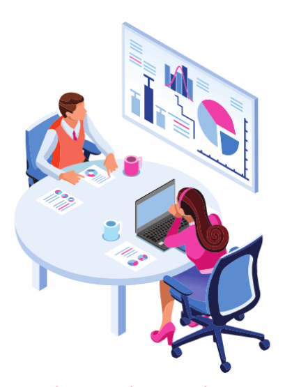
Business in various sectoral branches